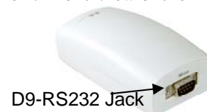
Figure 2: Rear View of the MD-N33