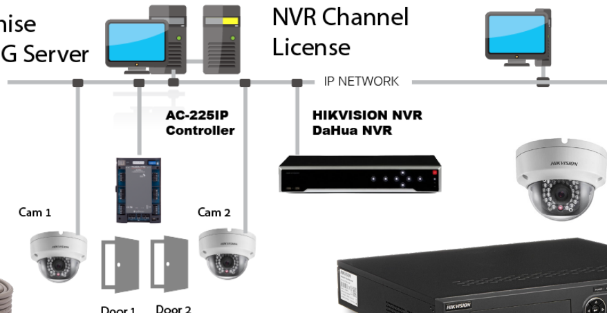
Example of 2 Camera Integration Setup with AxtraxNG Server