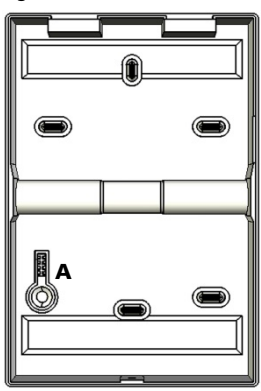
Figure 2: MD-W11 Back Cover

Use the spline key to remove the case security screw from the back of the unit (Figure 2).