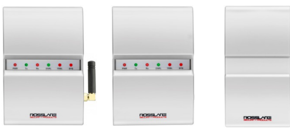
Figure 1: MD-W11 Interface

The MD-W11 consists of two units per door – one located near the controller (the Near Unit) and the other near the door (the Far Unit) (Figure 1).