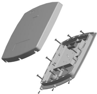
Figure 1: Removing the Top Cover

The reader must be mounted with the appropriate screws (not supplied), as described in the template provided.